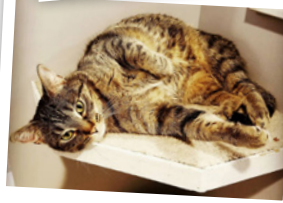
Jade – 3 years