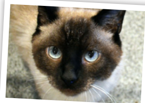
Valley (FIV+) – 2 years