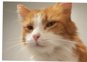
Gulliver (FIV+) – 4 years