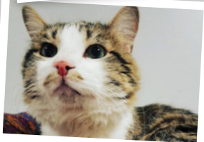
Stanley (FIV+) – 2 years