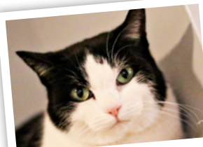
Sweetie – 3 years