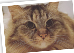
Tessie – 6 years