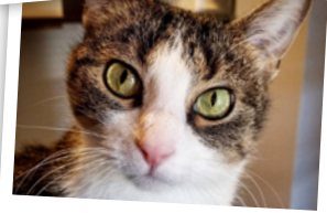
Tokuko – 3 years