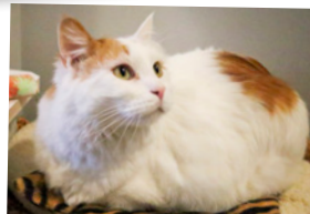
Benito – 9 years