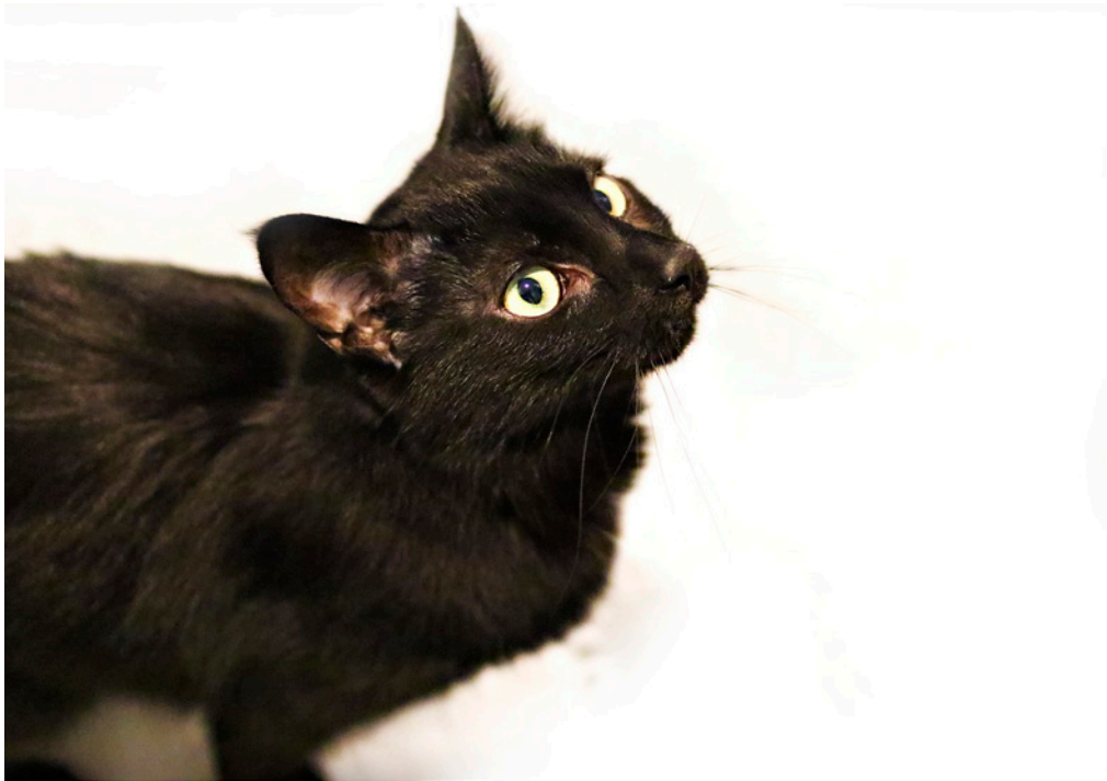
© Essence in a Flash by Kimberly McCarty

NON-PROFIT ORG US POSTAGE PAID PERMIT NO. 800