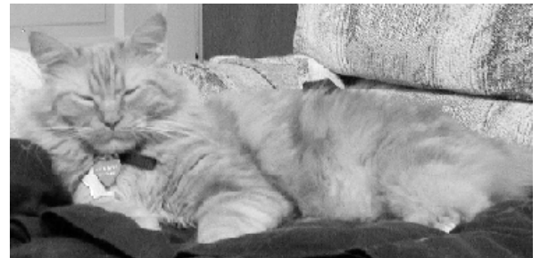
Relaxing after a hard day of....relaxing.