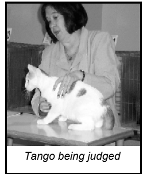
Tango being judged

In February Violet, Cami, and Tango (TCH kitties who have since found homes) strutted their stuff in the show ring as they were presented to judges at the Lincoln and Kansas City cat shows (household pet division). Violet took a 5th, 7th and 7th at the show in Kansas City. Cami took a 4th, 7th, 9th and 10th at the Lincoln Cat Show. Tango took a 7th, 9th, 10th and 10th at the Lincoln Cat Show. Congratulations! You are all winners and just purrrfect in our eyes.