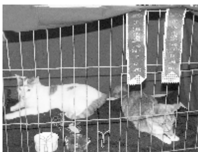
Tango & Cami, TCH kitties who took home many ribbons in the Lincoln 2005 CFA cat show.

Chili Greens Golf & Sports Dome 6808 Spring Street