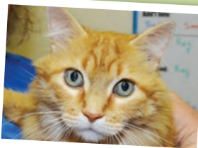
Pumpkin – 10 years