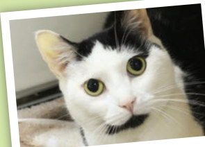
Chloe – 5 years