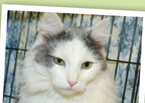
Sheba – 2 years