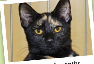
Speckles – 6 months