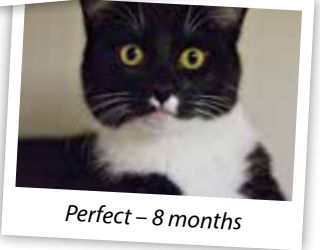
Perfect - 8 months