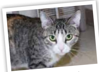
Rosetta - 6 years