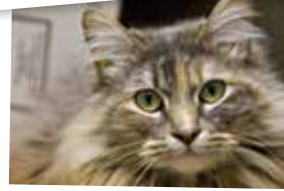
Little Nell - 2 years