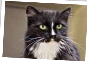
Oreo - 12 years