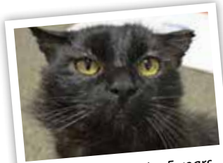
Simply Red (FIV+) - 5 years