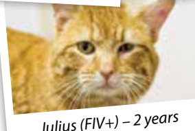
Julius (FIV+) - 2 years