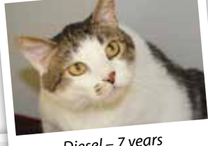
Diesel - 7 years