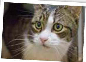
Atticus - 6 years

Visit our shelter on Tuesday and Thursday evenings from 6-8 pm and Sundays from 1:30-4 pm. You can also visit The Cat House kitties at the PetSmart adoption center located at 5200 N 27th Street.