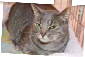
Noisy - 2 years