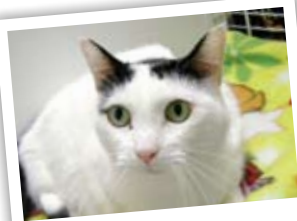
Penny – 3 years