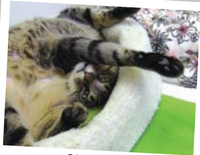
Ringo Starr Showing off for the camera!

Ringo Starr is a very special cat who is looking for his forever home. Stop by our shelter at 1935 Q St. to meet him and find out how amazing he really is. Just remember, "Don't Pass Me By."