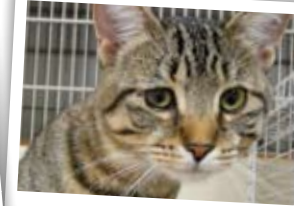
Merry (FeLV+) – 1 year

Visit our shelter at 1935 Q Street on Tuesday and Thursday evenings from 6–8 pm and Sundays from 1:30–4 pm. You can also visit The Cat House kitties at the PetSmart adoption centers located at 5200 N 27th Street and 2801 Pine Lake Road.