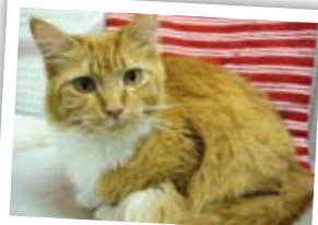
Tigress – 4 years